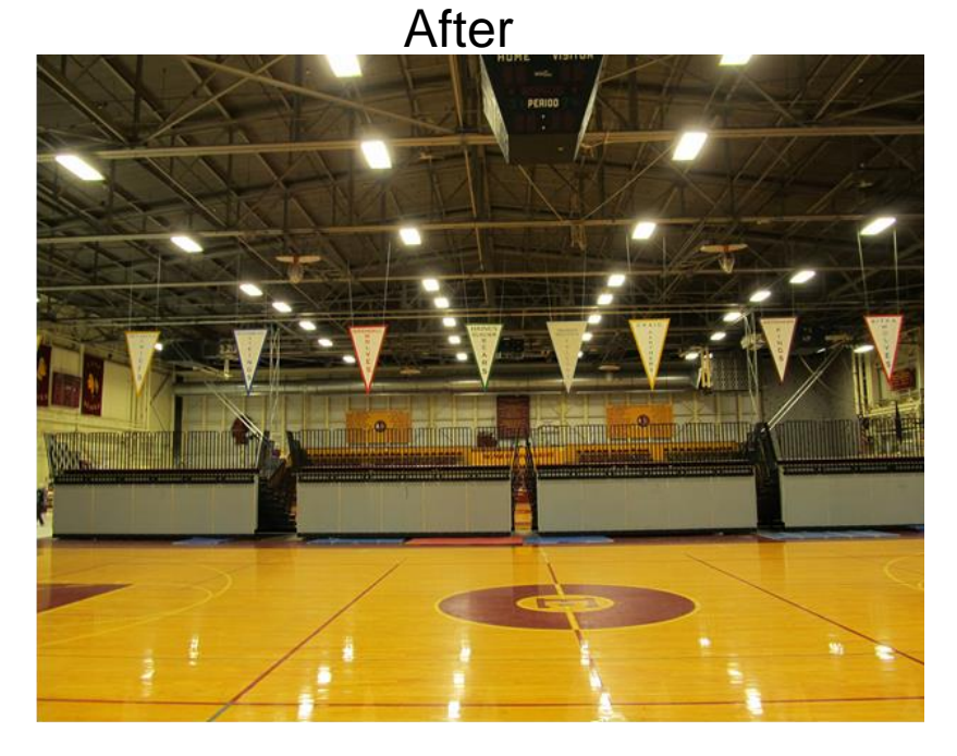
At Mt. Edgecumbe High School (Sitka) – new high efficiency fluorescent lights were installed in the Gymnasium-both reducing energy use and dramatically improving the gym environment.