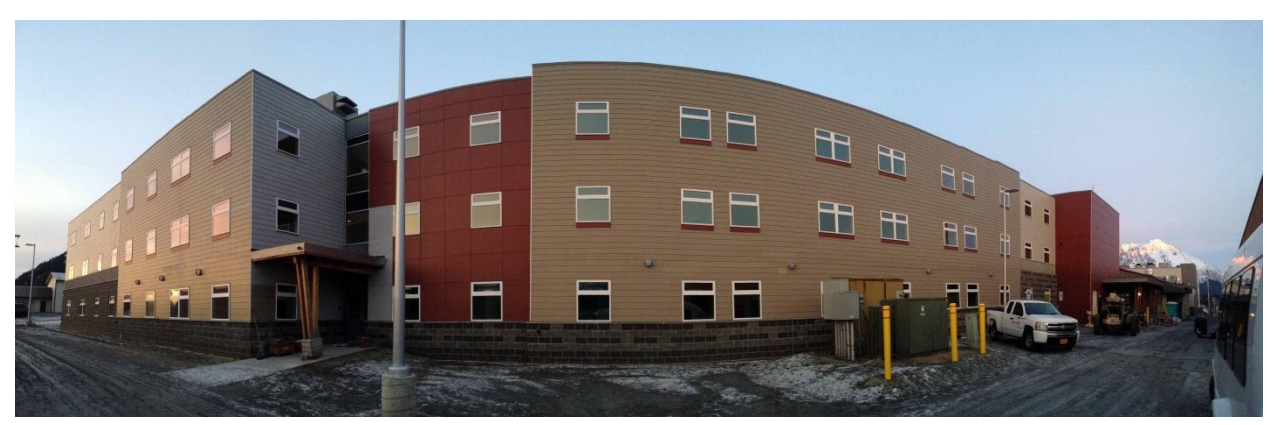
DOL- AVTEC Dormitory (Seward)

Statewide Public Facilities (SWPF) provides project management services for the planning, design and construction for both new vertical facilities (buildings) as well as renovation of existing facilities for most State of Alaska Departments.