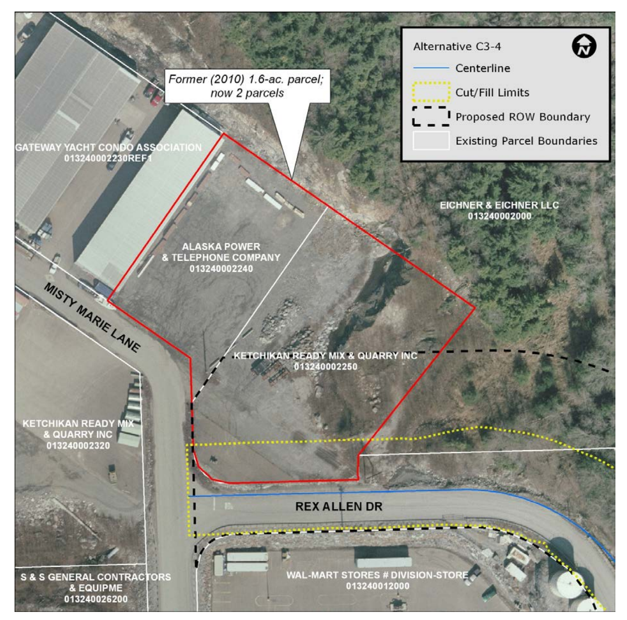
Figure 4. Ketchikan Ready Mix & Quarry, Inc. Property and Alternative C3-4

The 2010 ROW Report identified a vacant parcel at the intersection of Misty Marie Lane/Don King Road/Rex Allen Drive (parcel #013240002240) where a partial property acquisition would be required. The property, owned by Ketchikan Ready Mix & Quarry, Inc., was originally 1.6 acres in size (refer to red outline in Figure 4). According to the Borough's 2012 data, this parcel has been developed and subdivided, with the developed portion, a 0.6-acre parcel (now parcel #013240002240), sold to Alaska Power & Telephone Company. Ketchikan Ready Mix & Quarry, Inc., retains the 1-acre parcel (now parcel #013240002250) that is still vacant according to 2012 tax assessment records.