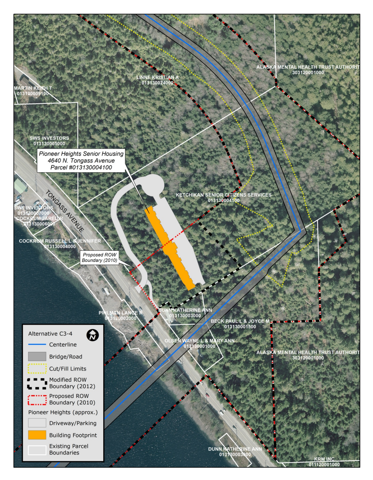
Figure 3. Pioneer Heights Senior Housing and Alternative C3-4