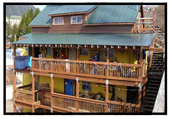
117 Inman Street Was <del>$299,000</del> NOW $249,000

Gateway Shoe and Vacuum Repair is For Sale. Price includes all inventory, cabinets, fixtures & the condominium it is in. Parking available nearby & great Tongass Avenue location. Wonderful opportunity to be you own boss! ( Hink )