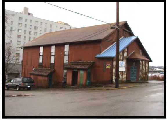
2409 First Avenue $290,000