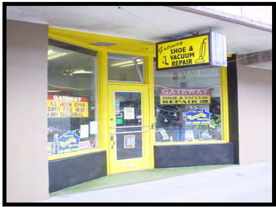
2206 Tongass Avenue $150,000

Gateway Shoe and Vacuum Repair is For Sale. Price includes all inventory, cabinets, fixtures & the condominium it is in. Parking available nearby & great Tongass Avenue location. Wonderful opportunity to be you own boss! ( Hink )