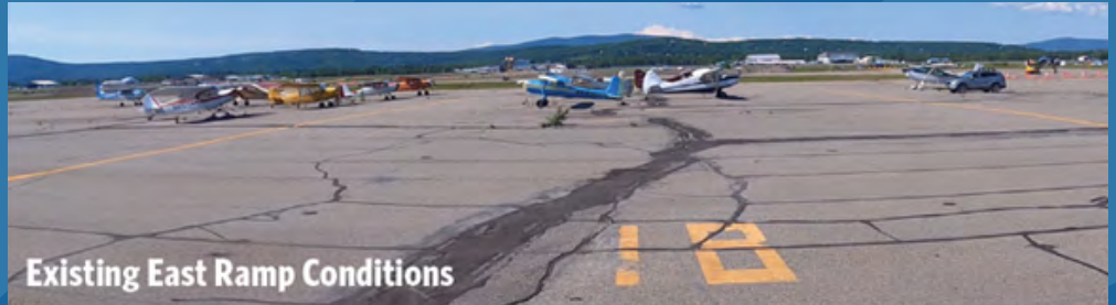
Existing East Ramp Conditions

This project concept was developed in the 2019 FAI Eastside Master Plan and is estimated to impact approximately 52 acres of paved surface.